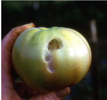
Hornworm damage on tomato

Hornworm damage usually begins to occur in midsummer and continues throughout the remainder of the growing season. The size of these garden pests allows them to quickly defoliate tomatoes, potatoes, eggplants, and peppers. Occasionally, they may also feed on green fruit. Gardeners are likely to spot the large areas of damage at the top of a plant before they see the culprit.